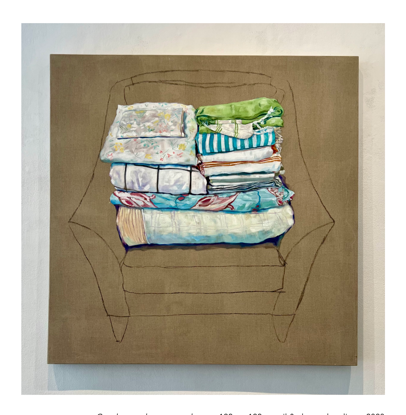
Good moms have messy houses,122cmx122cm, oil & charcoal on linen, 2023