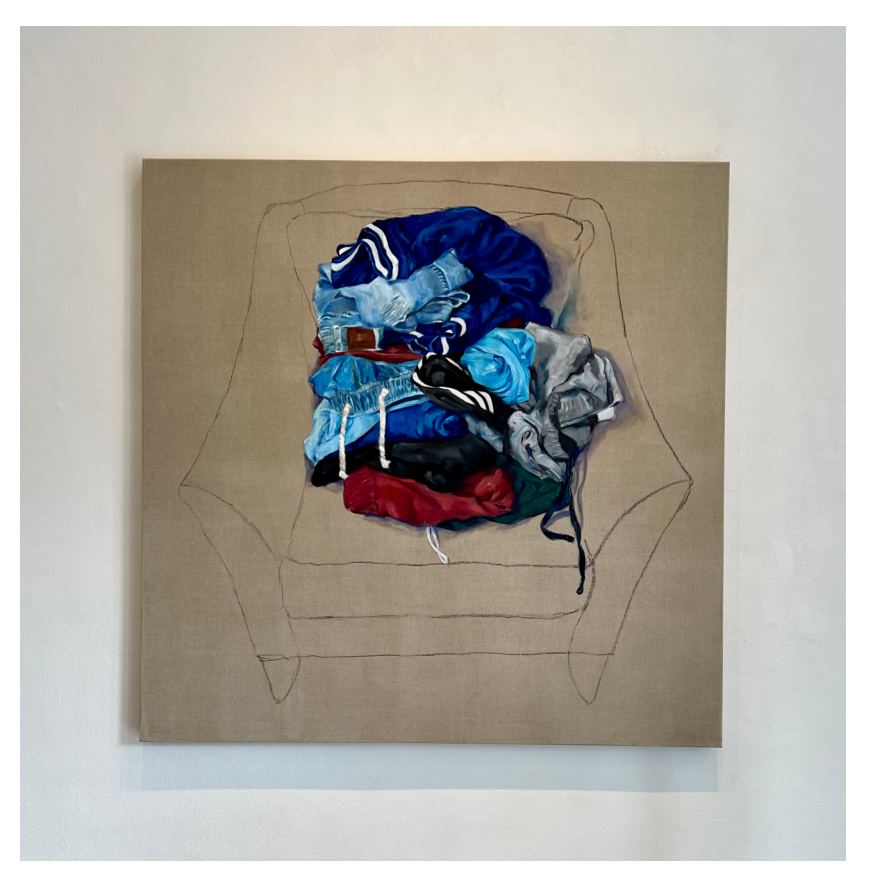
They might think we're broke, 122cmx122cm, oil & charcoal on linen, 2023