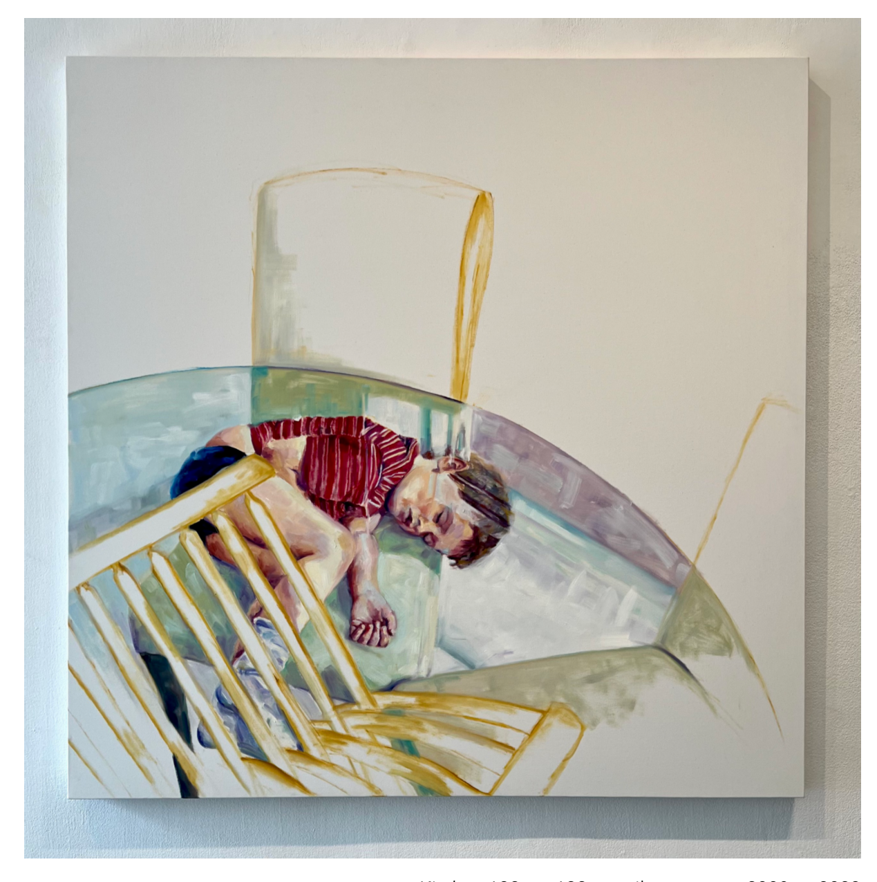
Kitchen, 122cm x 122cm, oil on canvas, 2008 to 2023

Learning how to see and be with others, to hold space and time for unfolding, is a radical reconfiguration of the gaze that puts care at its centre. Taking up the subjective positions of mother and painter, this project refers to process to consider the connections and incongruences between the practice of painting and the care practice of mothering. It contemplates how artwork might make publicly visible the maintenance and emotional labour of being alongside an other, and posits that painting can be positioned as a form of documentation for the mostly invisible parts of mothering. Drawing on autotheory and embodiment, my figurative paintings look outward from a practice of care to trouble the boundaries between art and life, public and private, practice and product, and artist and mother.