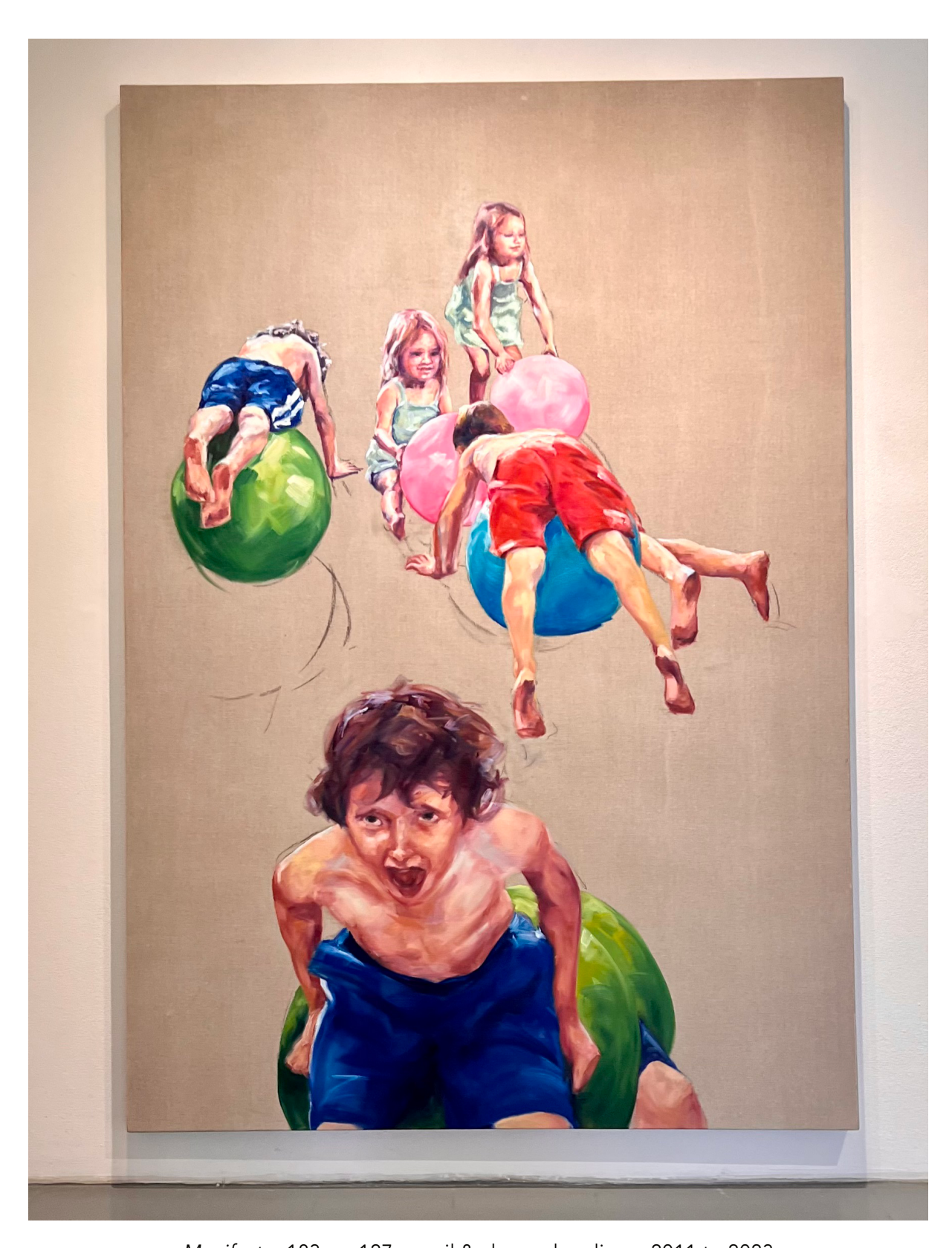
Manifesto, 183cmx127cm, oil & charcoal on linen, 2011 to 2023