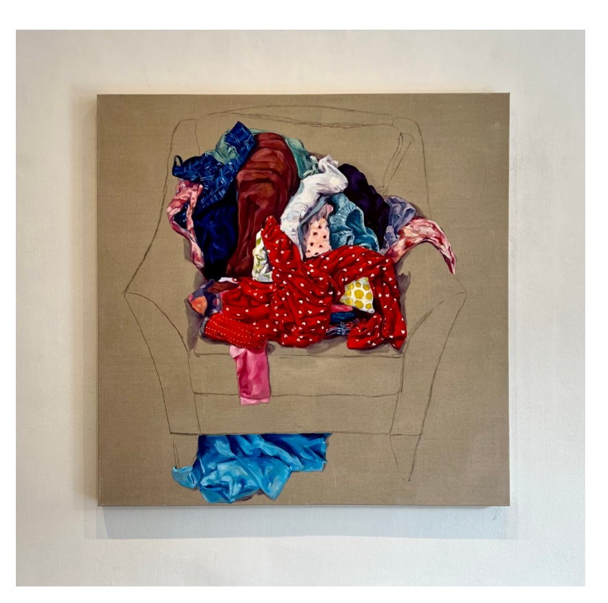
You look like no one loves you, 122cmx122cm, oil & charcoal on linen, 2023