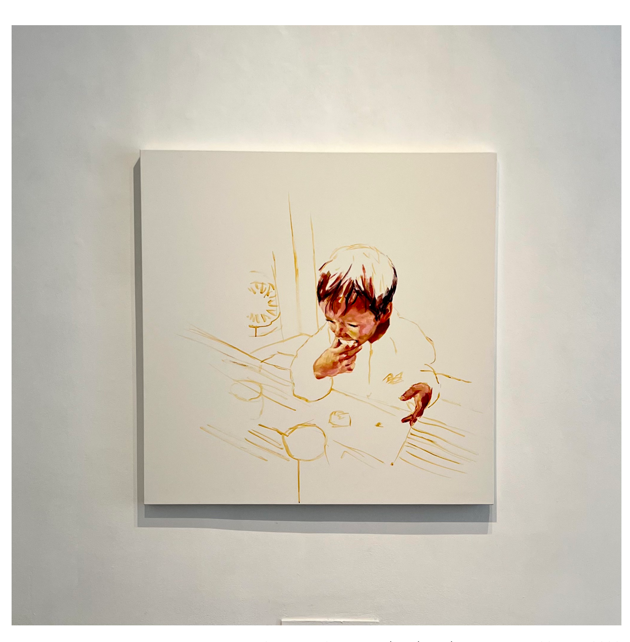
Dining Tent, 101.6cmx101.6cm, oil and acrylic on canvas, 2011 to 2023