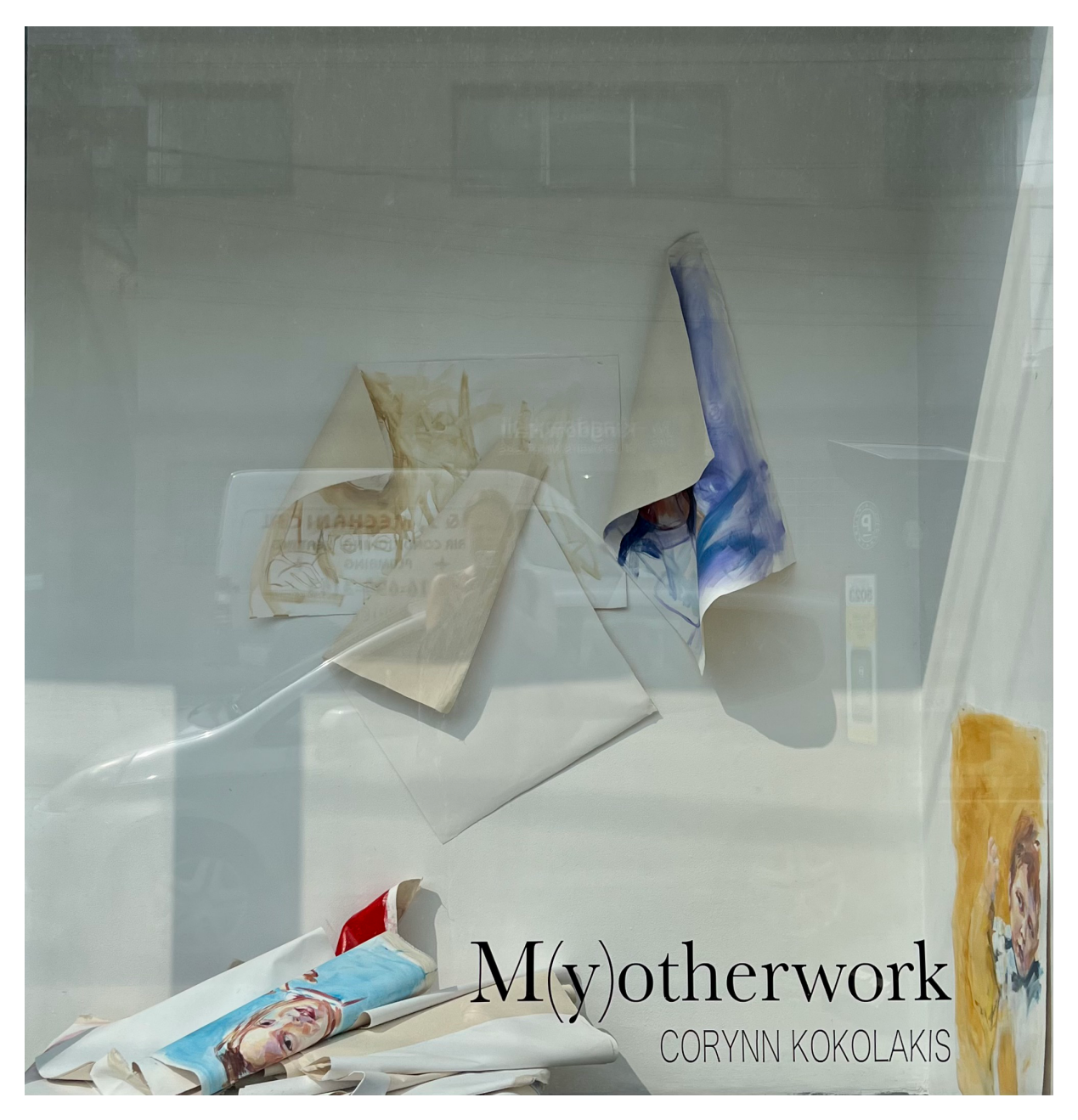
Praxis, variable, acrylic on canvas, 2023 -